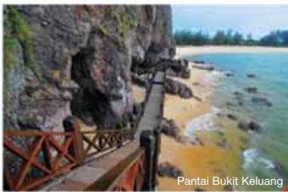
Pantai Bukit Keluang