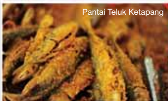
Pantai Teluk Ketapang