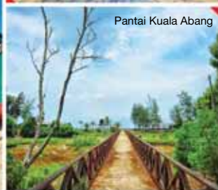
Pantai Kuala Abang