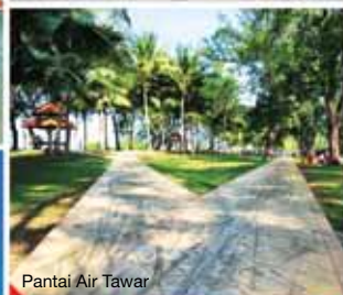
Pantai Air Tawar