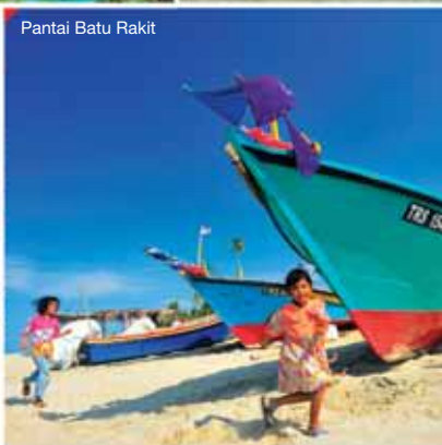
Pantai Batu Rakit