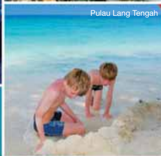
Pulau Lang Tengah