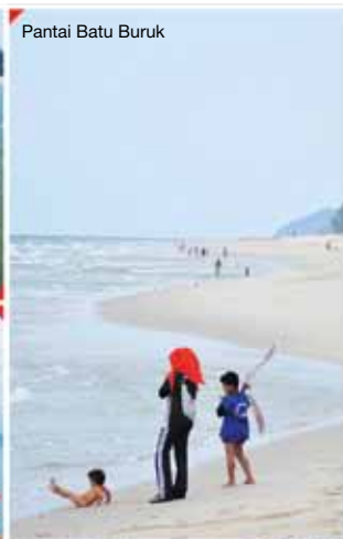
Pantai Batu Buruk